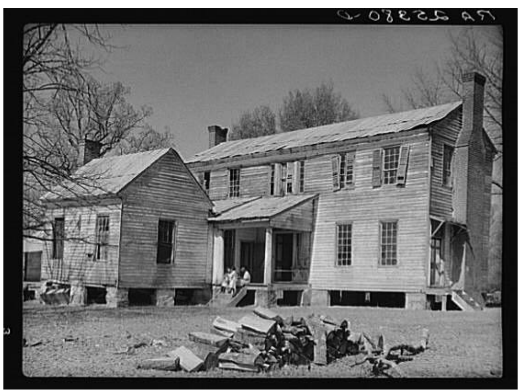
Arthur Rothstein , Home of the Pettways, now inhabited by Negroes. At Gees Bend, Alabama, 1937

Rothstein showed no such restraint in his photographs or his captions. In a number of captions he spoke of large families of Negroes at Gees Bend, Alabama, referring to them as "Descendants of slaves of the Pettway plantation. They are still living very primitively on the plantation." To further emphasize how the former plantation had fallen into ruin, Rothstein took the following picture of the Pettway mansion which he wrote was now "occupied by Negroes."