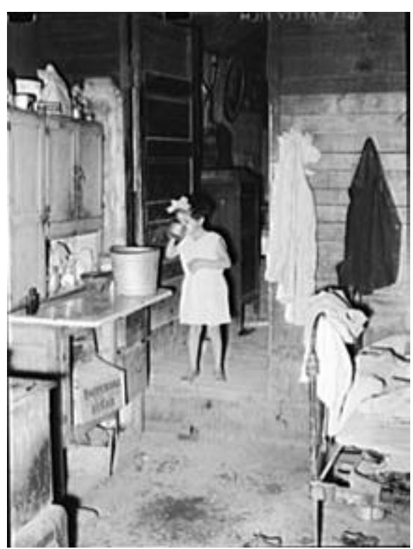
Figure 2: Interior of Mexican home. San Antonio, Texas.