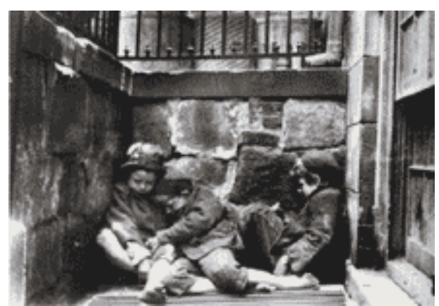
Jacob A. Riis, Street Arabs in Sleeping Quarters, c. 1880s

Riis did not limit such arrangements to the street toughs but posed more than a half a dozen images of young boys sleeping in stairwells and doorways. The pictures appear to have been taken in broad daylight and the small subjects are obviously pretending to be asleep. Whether they were indeed homeless remains a question open to modern viewers, but not one likely to have been asked by the photographer's contemporaries.