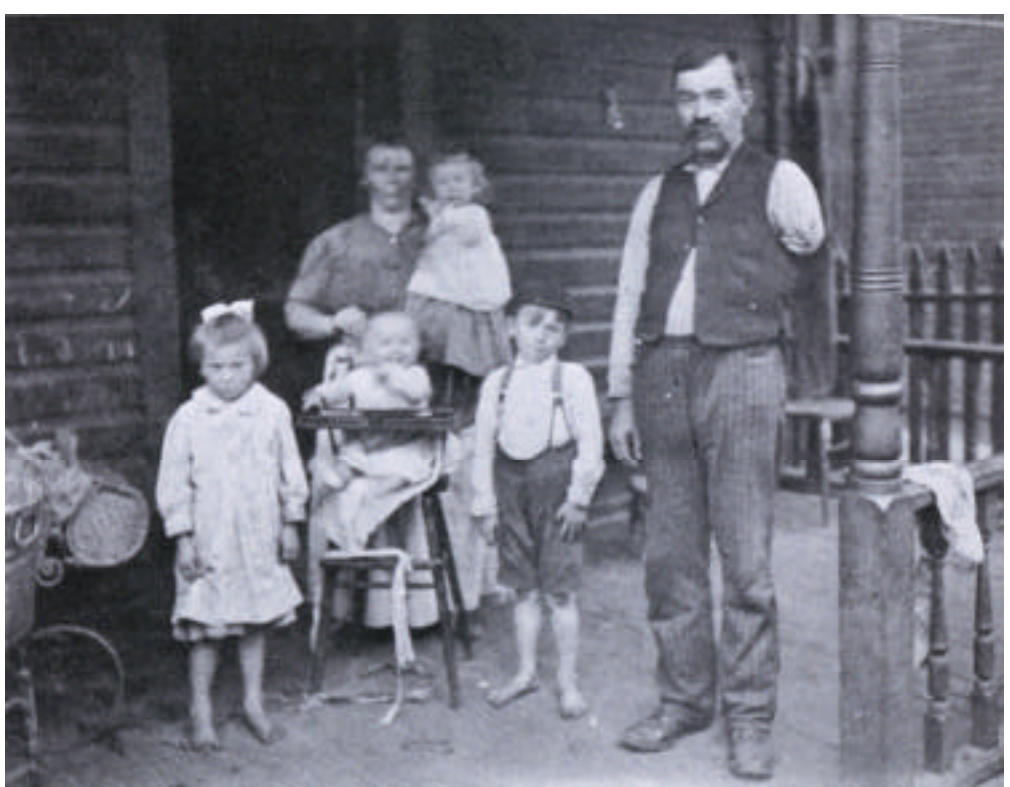
Lewis Hine, One Arm and Four Children, 1910

Lewis Hine employed similar strategies in his photographs of newly arrived immigrants and downtrodden factory workers. Like Riis, Hine placed great faith in the power of accompanying words to drive home the point of his images.