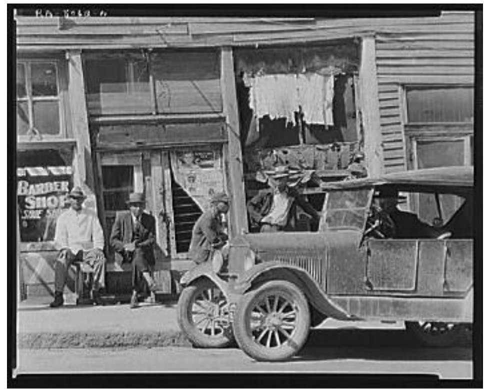
Walker Evans, 1936

In this 1936 picture of African-American men in front of a Vicksburg, Mississippi, barbershop, Evans arranged his subjects so that they appear to be unaware of his presence. One of the males seated on the bench is turned at right angles to the